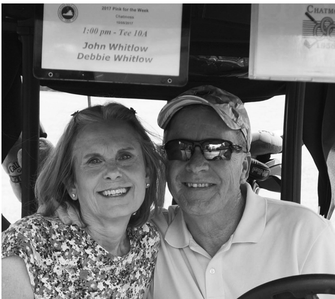
Pink for the Week