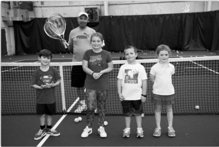
Junior Tennis Players