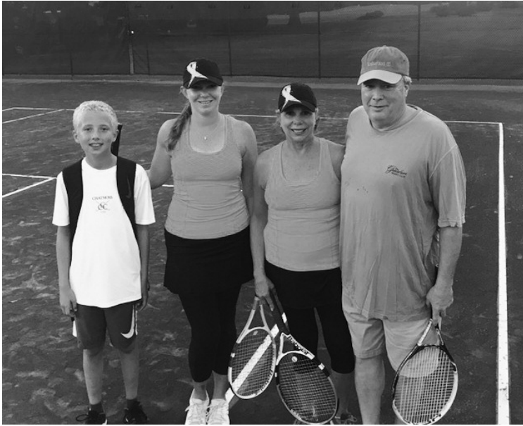
Pink for the Week